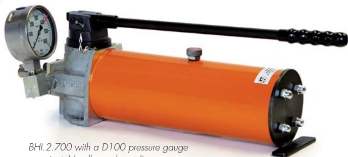
BHI.2.700 with a D100 pressure gauge on orientable elbowed coupling